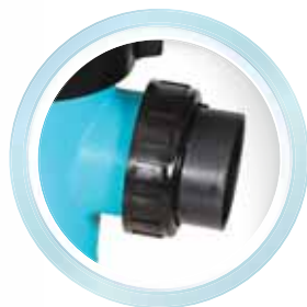
d.110 slip connection