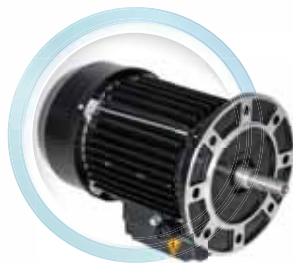
Stainless steel motor shaft